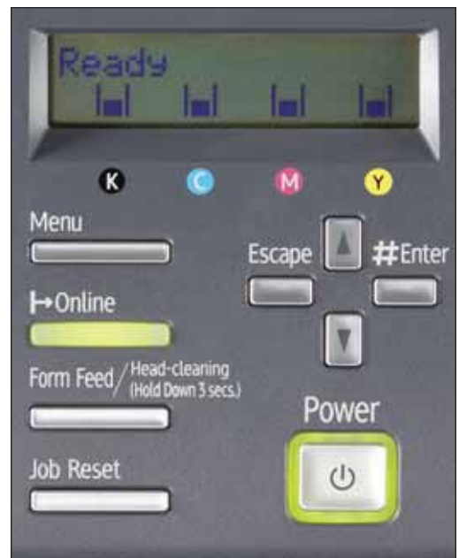
The GX7000 control panel features a simple, user-friendly layout.