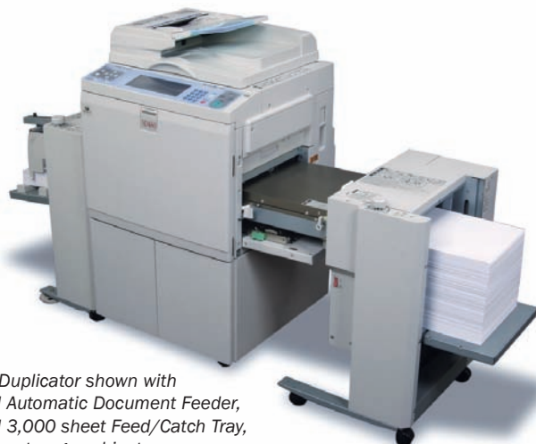
SD460 Duplicator shown with optional Automatic Document Feeder, optional 3,000 sheet Feed/Catch Tray, and base storage cabinet.